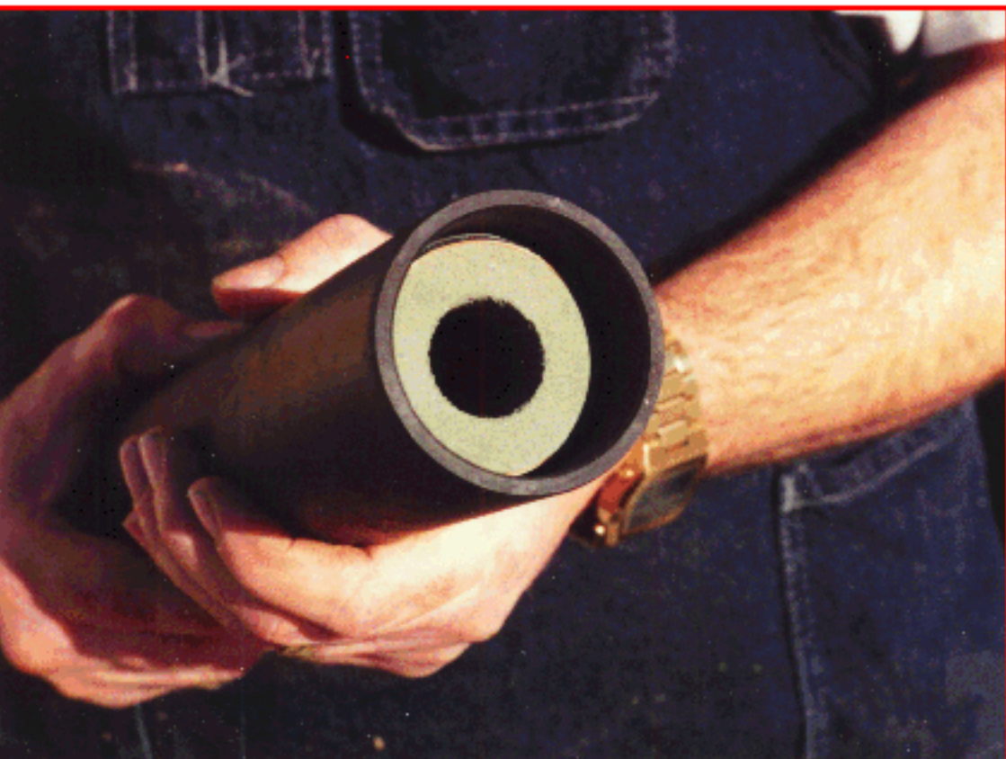
Composite propellant ignitor grain shown installed on top of hybrid grain.