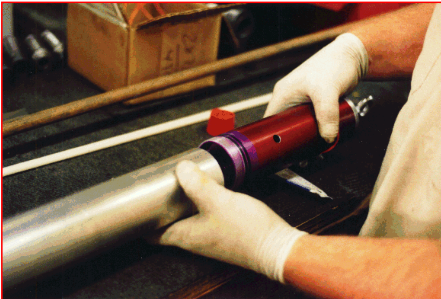
Attaching vented forward bulkhead to nitrous tank.