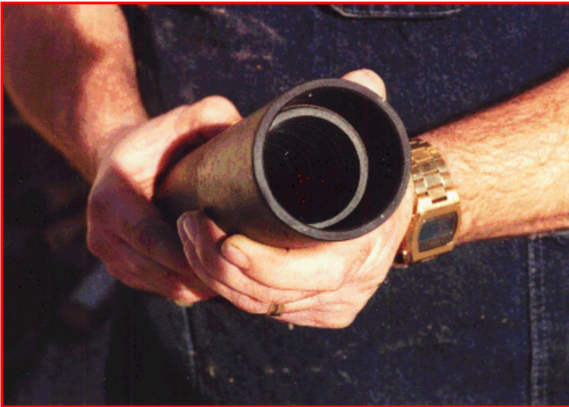
Hybrid starter grain shown installed.