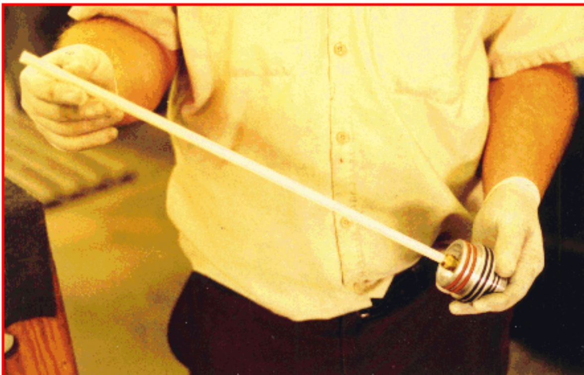
Installing nitrous fill line to compression fitting.