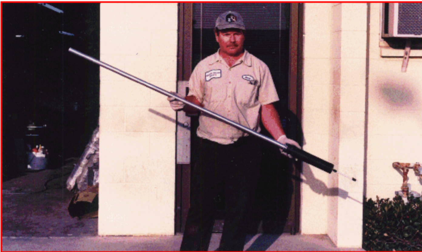
Shown with the combustion chamber attached.