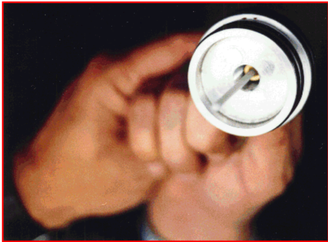
Bi-propellant injector with alcohol plug installed.