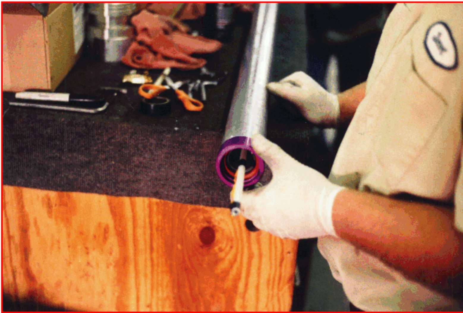
Attaching rear enclosure to nitrous tank.