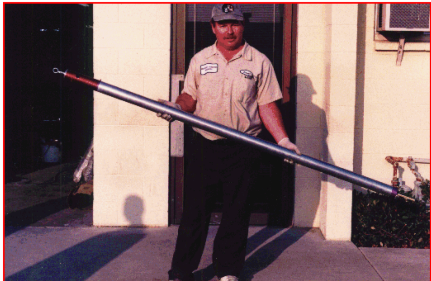
Shown here with fully assembled M-500 bi-propellant rocket motor, Note, red section is the smoke tracking chamber.