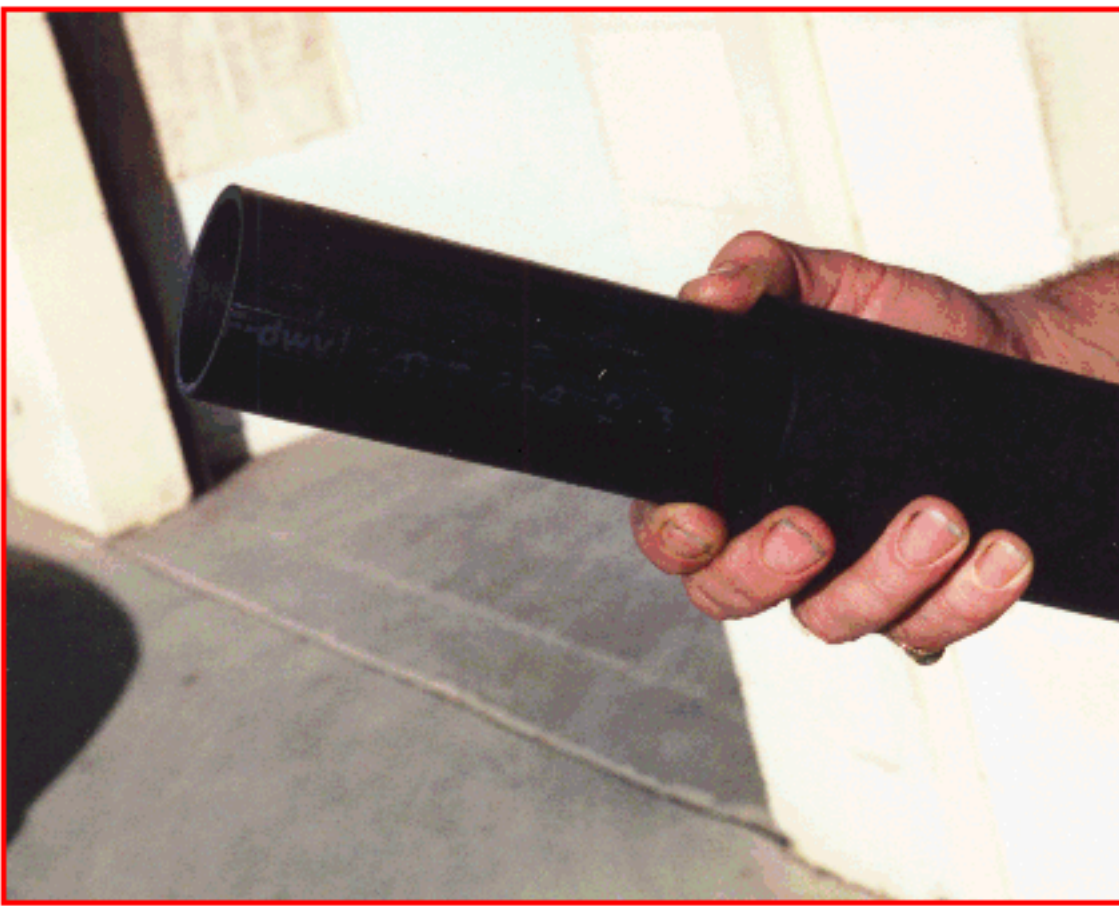
ABS hybrid starter grain being installed into combustion chamber.