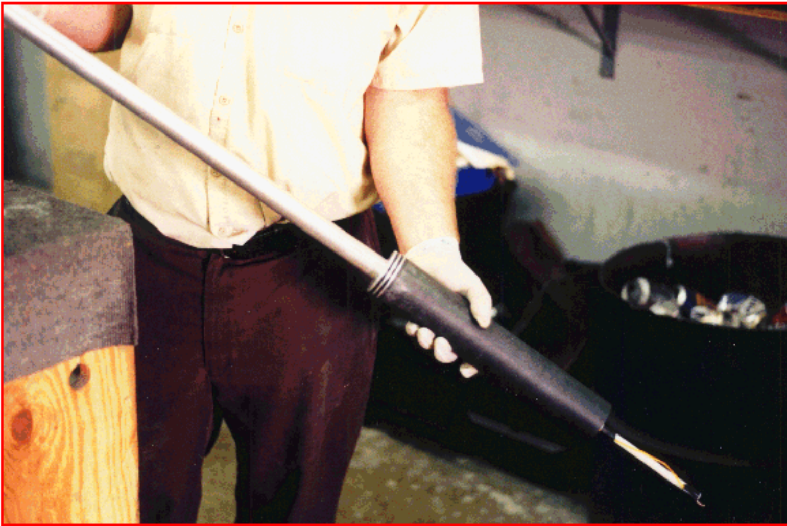
Attaching fully loaded alcohol tank and injector valve to the combustion chamber.