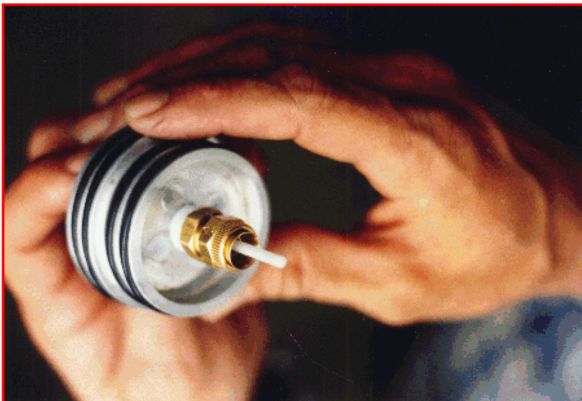
Nitrous fill line compression fitting installed, Note alcohol plug extending.